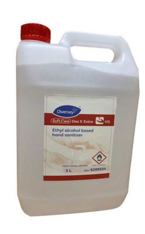
Diversey Hand Sanitizer