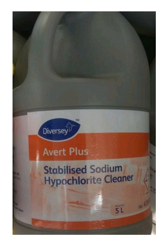
Diversey Avert Plus sodium hypochlorite