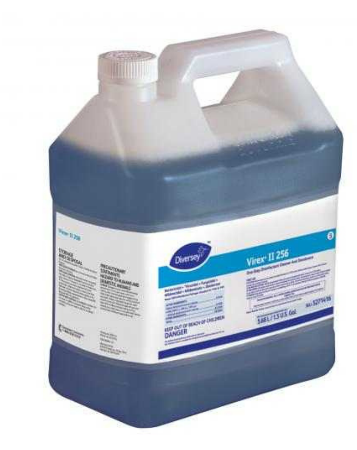
Virex® II 256 One Step Disinfectant