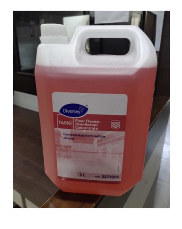
Diversey Taski Floor Cleaner Disinfectant Concentrate