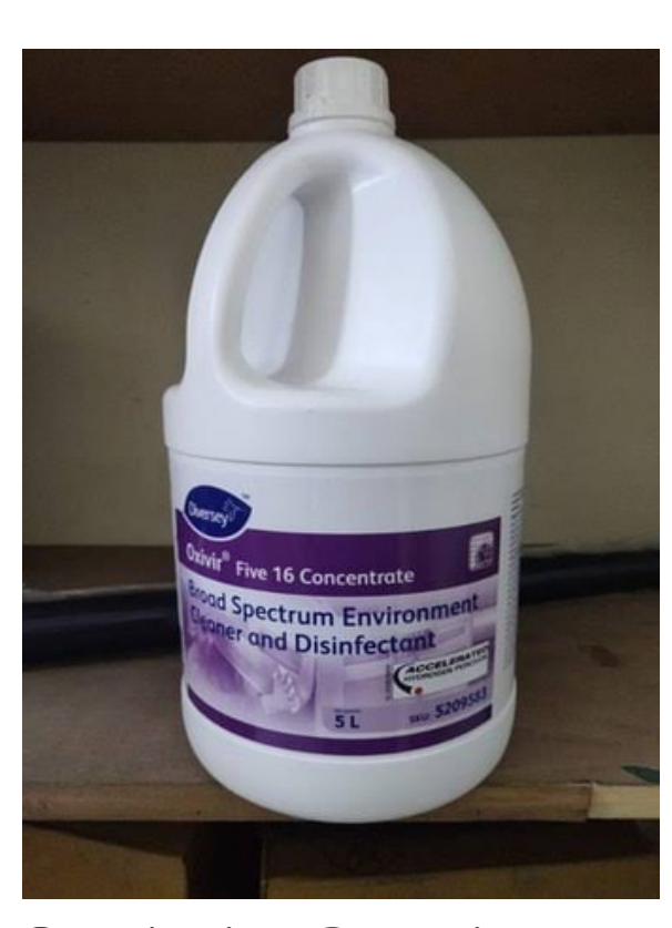
Oxivir® Five 16 Hydrogen Peroxide